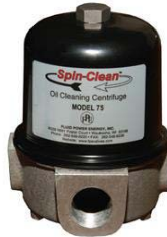
Model 75 & 75-1

The lube oil cleaning Centrifuge removes the solids from the engine oil using centrifugal force, a force of 1000 "G's", or 1000 times the force of gravity. These solids are stored inside of the rotating turbine bowl, which will hold more than 10 times the solids of your engines full-flow filters. The act of exposing the oil to 1000 "G's" is what results in micron removal less than one. Once the particles have been removed the clean oil is then returned to the oil pan.